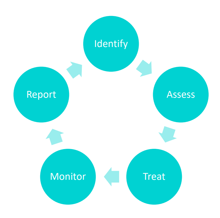
Fig 1 - The Risk Management Process

More information on the activities undertaken at each stage of the risk process are detailed in the forthcoming chapters of this document.